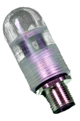
Actual size shown SB-011QD LED strobe